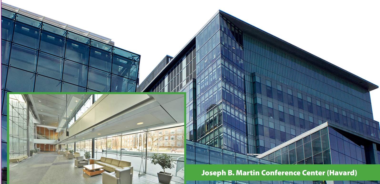
Joseph B. Martin Conference Center (Harvard)